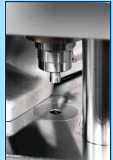
Upper punch with compression chamber