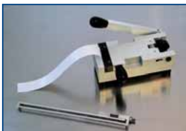
Coding writing group