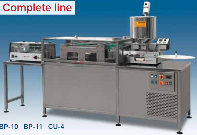
BP-10 BP-11 CU-4