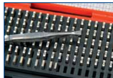
Box of 100 characters