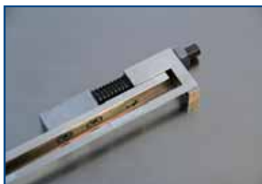
Stainless steel ribbon